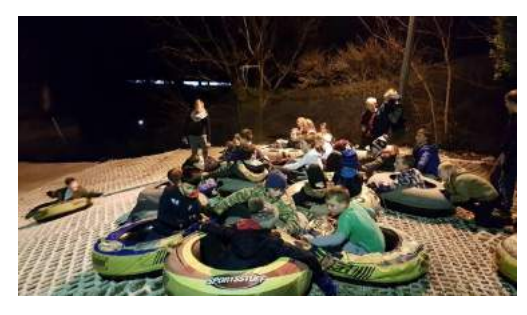
Tobogganing on a cold wintery night.

The rest of the term consisted of many outdoor activities, even on the dark and wet nights, ending with an investiture on a moving toboggan! The first for Bagheera.