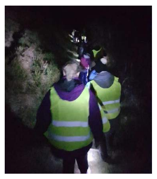
Night hike on the slippery slopes of Sugar Loaf 'mountain'.

The Cubs have taken part in many activities over the past year, including hikes around different parts of Folkestone – taking in the beautiful coastline to the heights of the Downs.