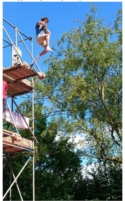
KIJ 'Bag Jump' (don't worry, there is a big air bag right under him!)

The Explorers attended the Kent International Jamboree in August with the Scout Section and had the opportunity to try many new activities.